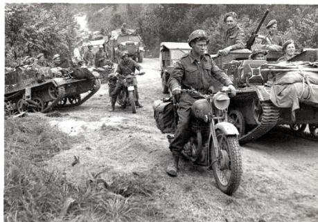
Advance to Vire, near Caen, Normandy

A formation of 100 men from the Regiment landed on D-Day itself, 6 th June 1944, their task Beach Traffic Control. The rest of the Battalion followed, taking part with the 7 th Battalion in the fighting to capture Caen.