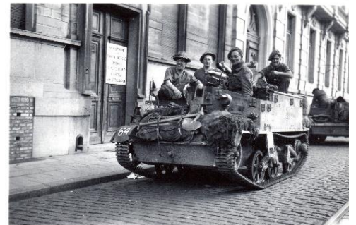
Machine gun carrier passing through Antwerp, Belgium

The 4 th Battalion operated as three Independent Machine Gun Companies, each with a 4.2" mortar platoon. The Companies were attached to the 7 th , 11 th and Guards' Armoured Divisions. No.3 Company landed at Arromanches on 9 th June 1944; No.2 Company on Sword beach on 14 th June; No.1 Company at Le Hamel on the night of 25 th June. By September they had all reached Belgium.