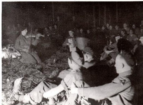
The night before crossing the Rhine

The Regiment fought through northern France, Belgium, Holland, crossed the Rhine in March 1945, and ended the war in Bremen, Germany.